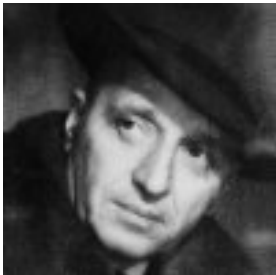
The Great Hero – Jan Zabinski, the Zookeeper

The movie illustrates that you need not be a born hero to do extraordinary things but the sense of heroism comes from within. The movie is captivating and enriching for all those who are ready to take in the truth of life.