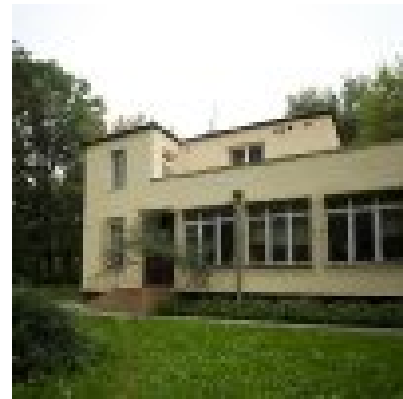
The Safe Haven