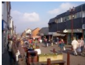
Upper Bath Street.